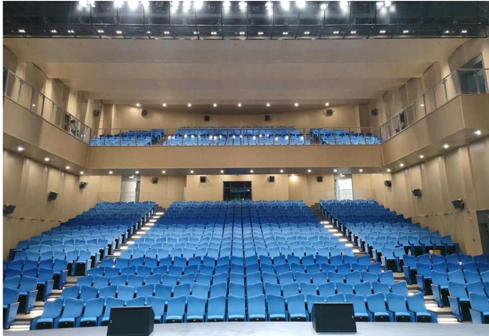
Victoria installation with customized with waved shape back cushion