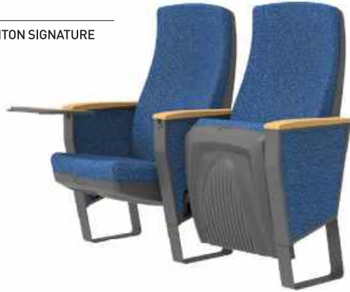
LEIGHTON SIGNATURE L-A01