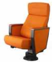
ARTHUR AXIS L-A02S