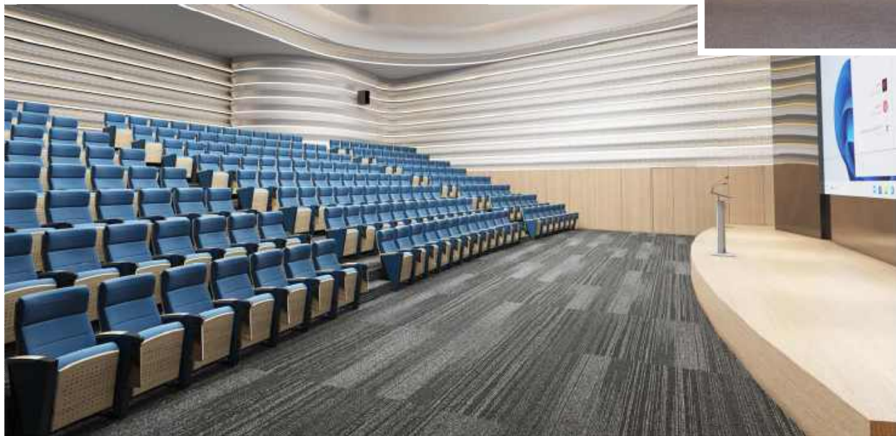
ARTHUR ELITE PLASTIC L-A06-1 (Stowed wooden tablet)