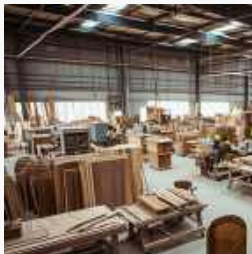
Wood Furniture Factory