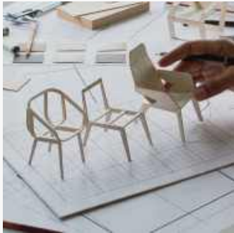
Share drawings or concept