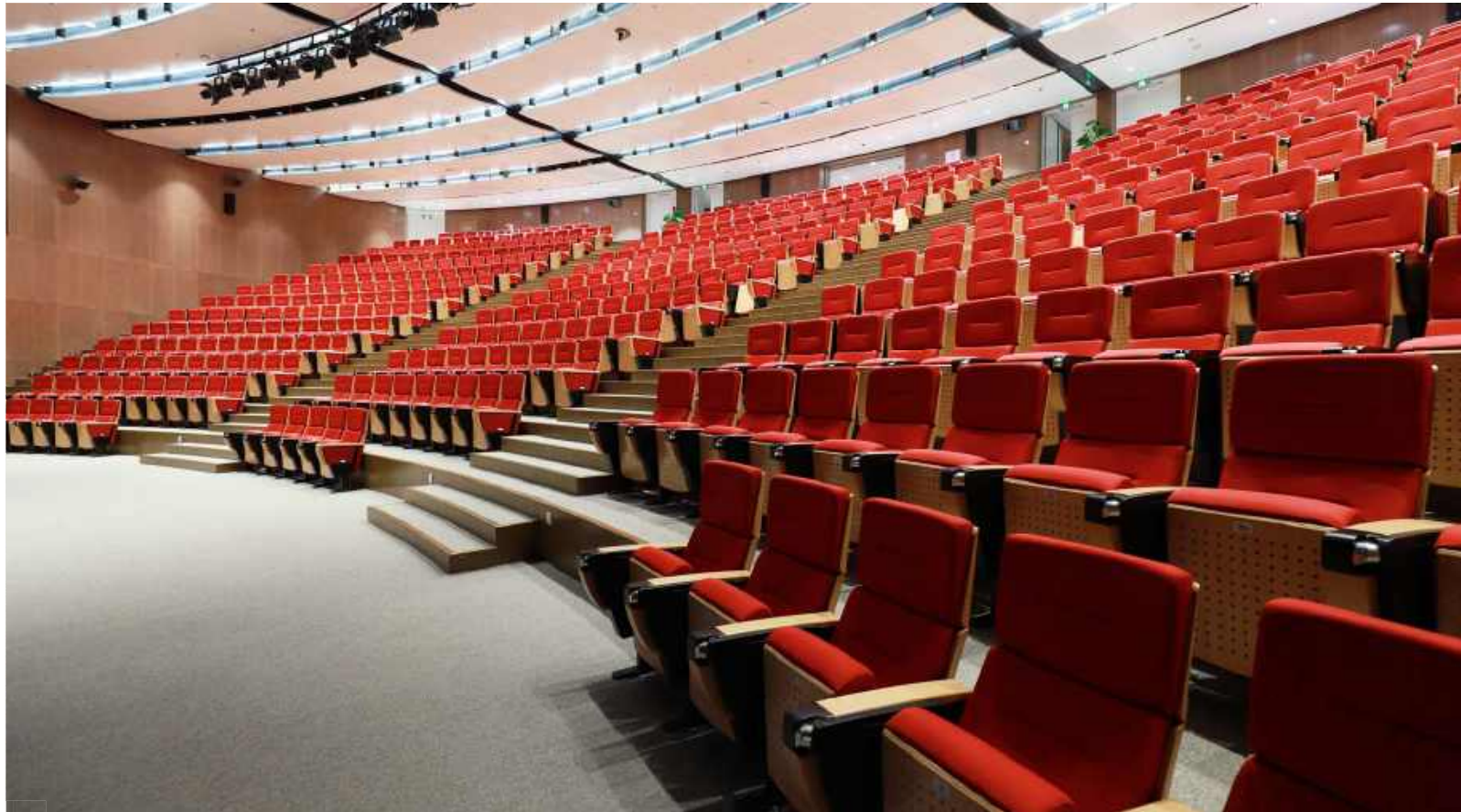
HERMAN LUX LS-21602A