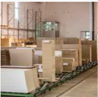
Packing & consolidation