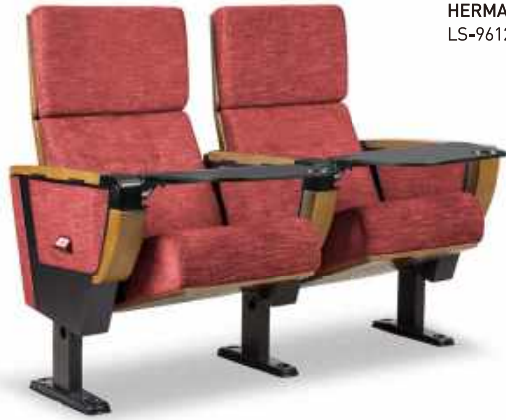
HERMAN SIGNATURE LS-9612

You will never be disappointed with what HERMAN can offer – an elegant design, ultra-comfortable moulded foam and a functional writing tablet. It can be fitted with an optional customised arm to provide a built-in simultaneous interpretation facility or audio facility as the right fit for high-end multi-purpose venues such as conference centres.