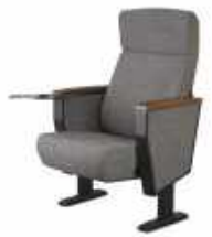
ARTHUR LITE L-A02-1