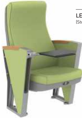
LEIGHTON ACE L-A07P (Stowed ABS tablet)