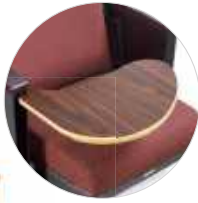
ARCADIA PLUS LS-20603 Series