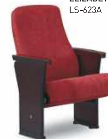
ELIZABETH UPHOLSTERY LS-623A