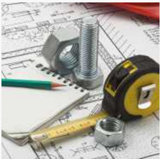
We refine engineering details