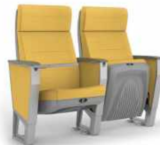
ARTHUR ELITE PLASTIC L-A06-1 (Stowed wooden tablet)