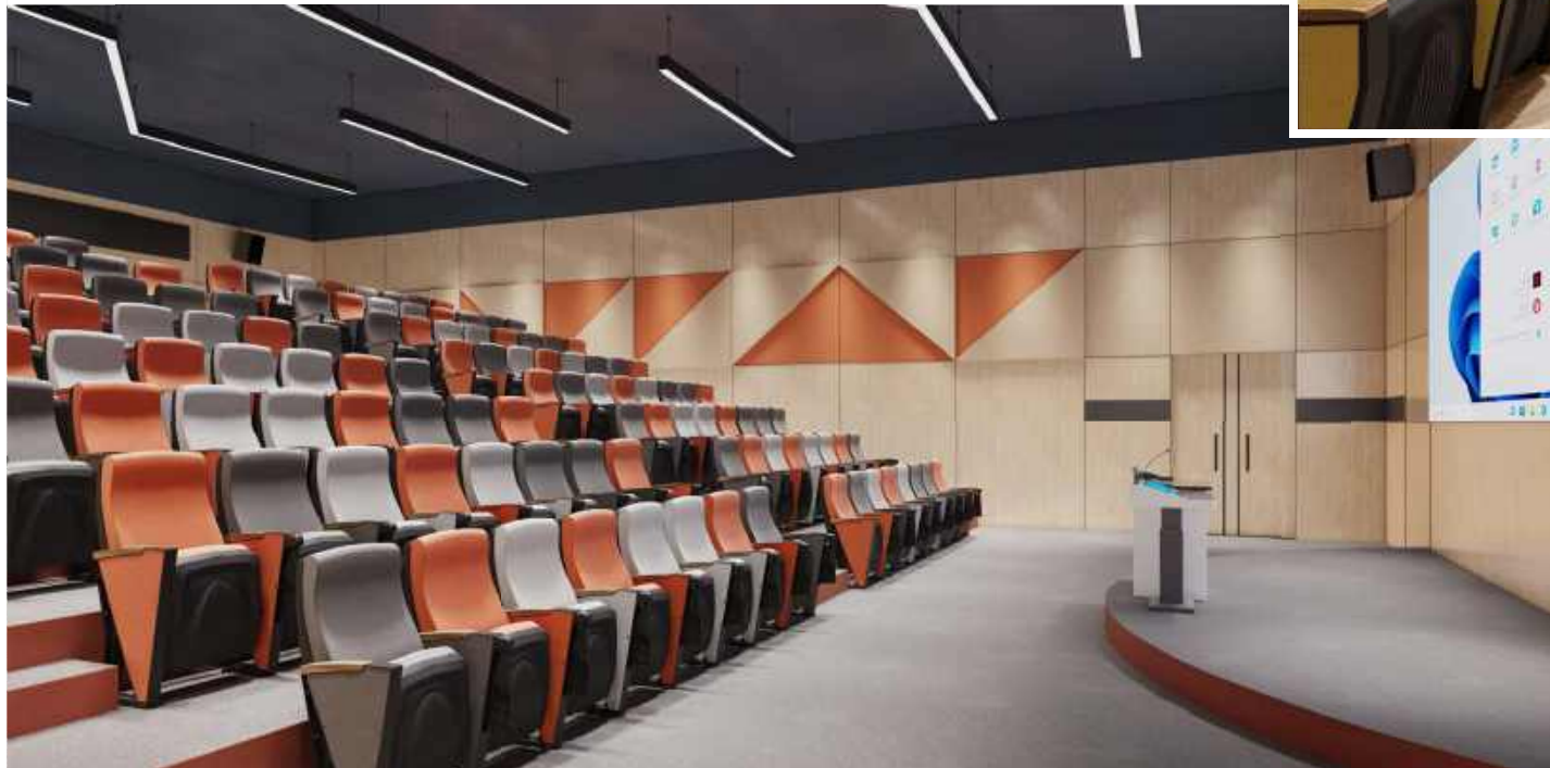
LEIGHTON ELITE L-A06 (Stowed wooden tablet)