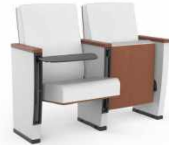
FIPO LUXE L-A03