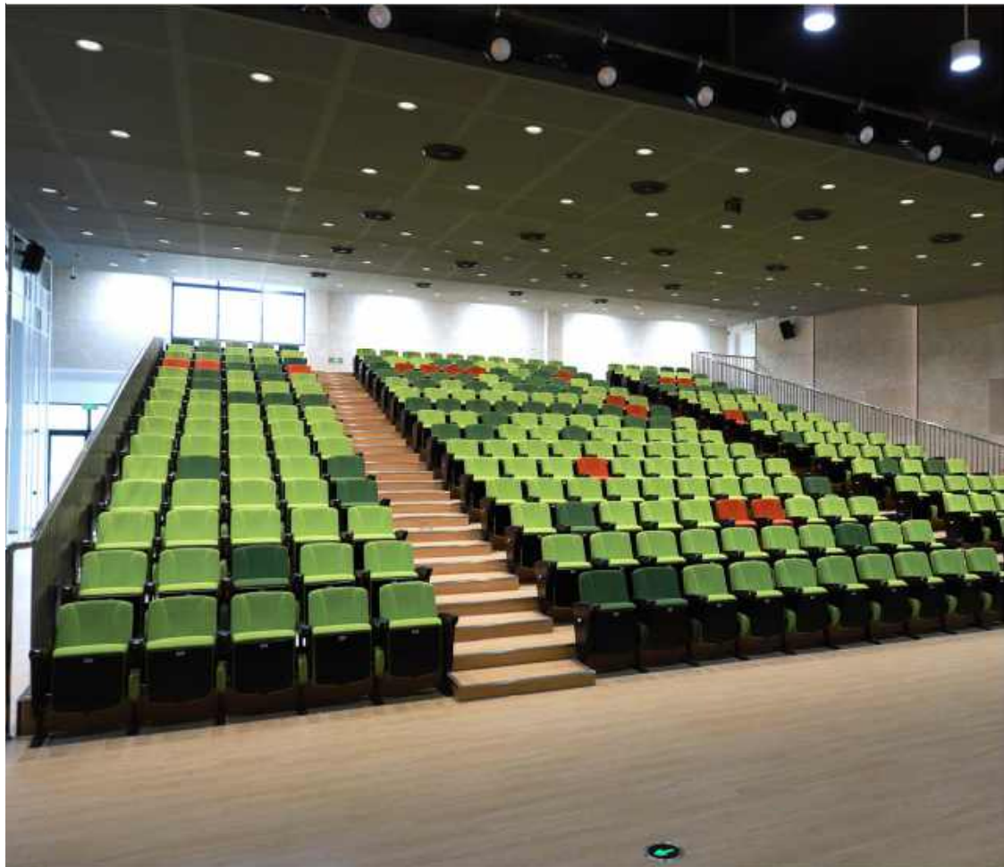
LOUISVILLE UPHOLSTERY LS-10601