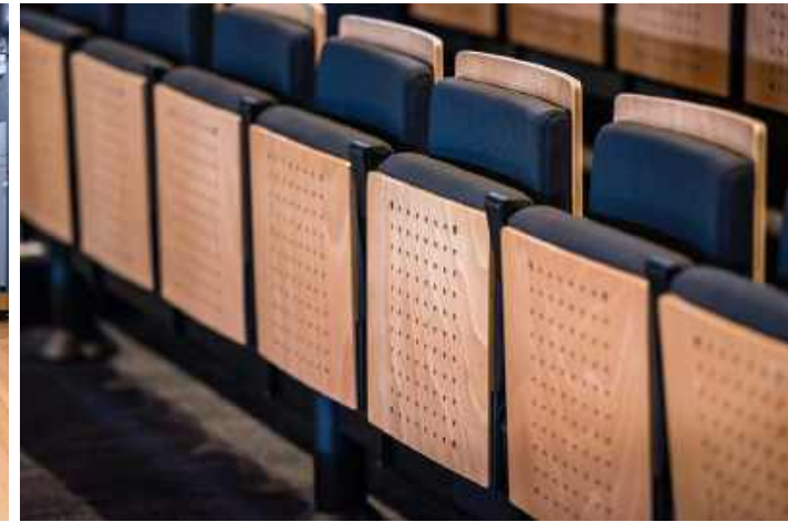
MOLIO WOOD AXIS L-A12