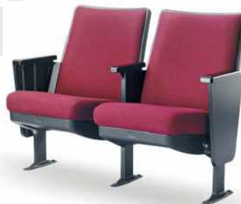
PERFORMER WOOD LS-13601W