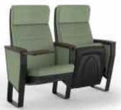
ARTHUR PLASTIC L-A05