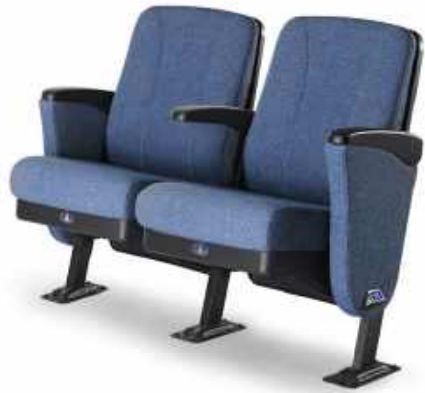
LOUISVILLE PLASTIC LS-10601P