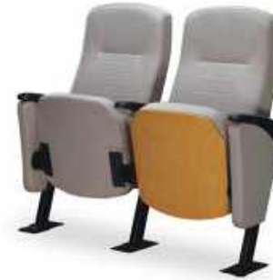
GLASTON LS-6619 Series