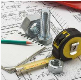
We refine engineering details