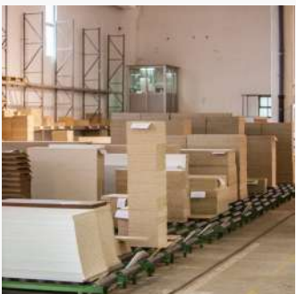
Packing & consolidation