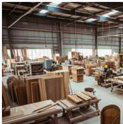
Wood Furniture Factory