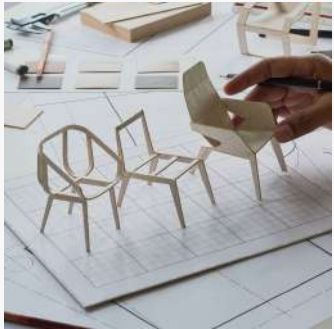
Share drawings or concept